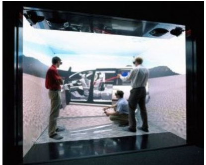
Figure 1: CAVE room

The CAVE is an immersive virtual reality environment in which projectors are directed to the rear of the walls of a room-sized cube. Apart from its obvious resemblance to one, CAVE is a reference to the work/writing "Allegory of the Cave" of the classical Greek philosopher Plato, in which a philosopher contemplates perception, reality and illusion<sup>(2)</sup>.