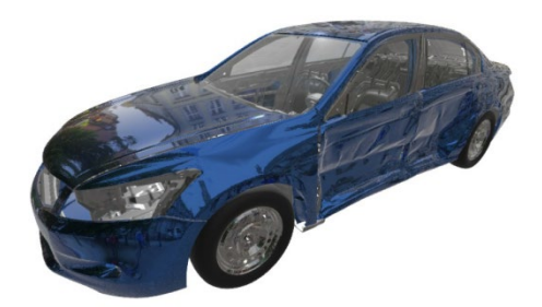
Figure 3: High quality rendering in META

The requirement of engineering software, particularly for an immersive CAE simulation results' visualization, led BETA CAE Systems to develop the support of the HTC VIVE and Oculus Rift virtual reality headsets from META, its multi-disciplinary CAE simulation post-processing software. Multi-disciplinary implies that META natively supports and is able to read a wide array of CAE files from different types of analyses (crash, durability, NVH, CFD) and solvers, including LS-DYNA<sup>®</sup>. META is highly optimized for results' extraction and reporting through automation and, coupled with high quality graphics and advanced rendering capabilities using PBR (physically based rendering) materials and HDR (High Dynamic Range) environment images, can present supported simulation results in a very realistic manner.