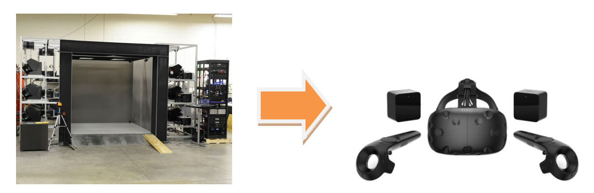
Figure 2: CAVE room vs HTC VIVE headset

For a significant number of use cases, a CAVE setup can literally be replaced by one of these headsets: