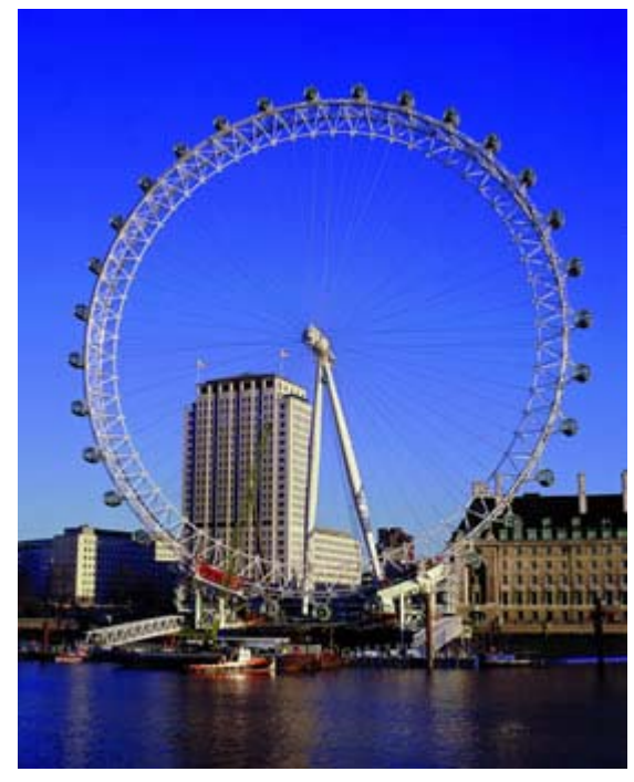
Iv-Infra depended upon ANSYS' nonlinear capabilities to analyze gap and spring models.

One example of rigorous engineering is the British Airways London Eye. Standing at more than 135 m and 120-ft taller than Big Ben, the London Eye is the world's largest observation wheel - a far cry from the original 250-ft. Ferris wheel invented by George Ferris Jr.